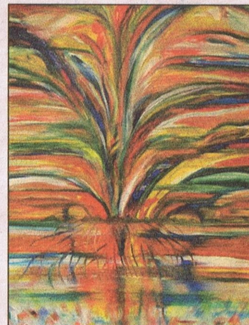
'Ombrello's Nature's World'